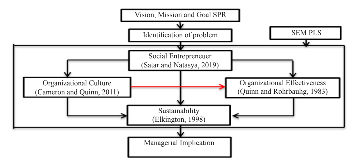
Figure 1. The Research Framework