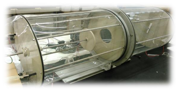
Figure 1. The Teflon chamber system with 128L (64 L ×2 compartments).

of dust aerosols, the dust aerosol generator was prepared with of conventional impinger and silicon tube. The particle free air was introduced through silicon tube to blow off and emitted out the dust particles. For the generation of bacterial bioaerosols, a compressor type nebulizer was employed. This type was rather gentle to aerosolize bacteria. For the measurements of the particle concentration and size distribution, an optical particle counter was used.