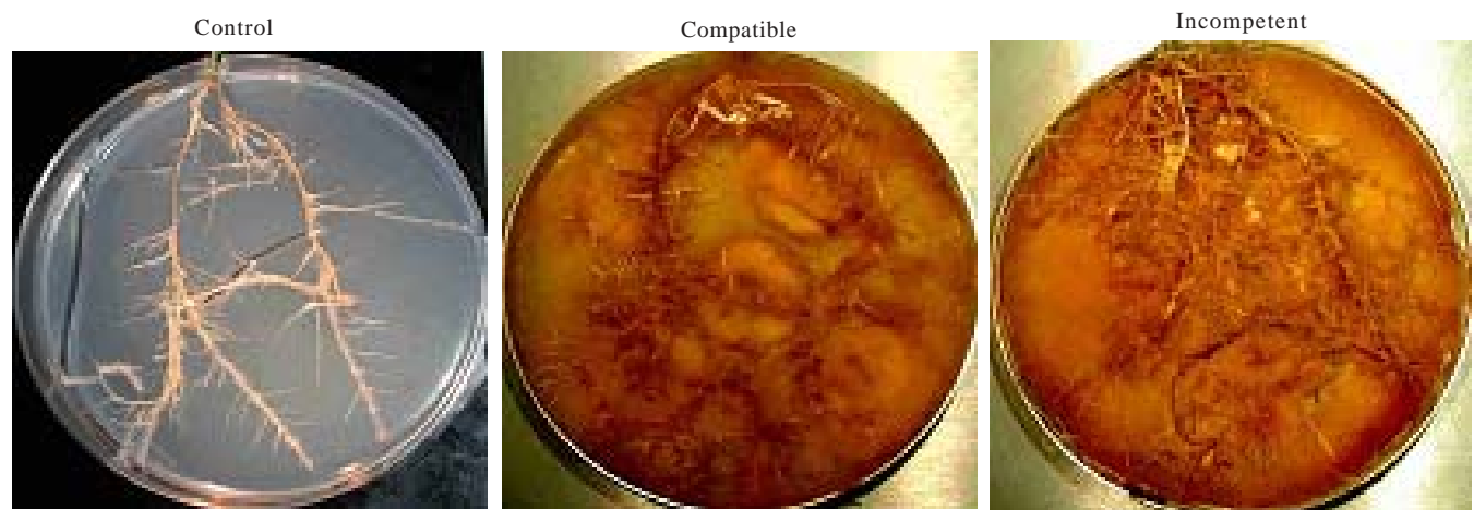
Figure 1. Root systems of poplar in control plant (left) and plants inoculated with compatible MAJ (middle) and incompetent NAU (right) P. involutus isolates.

Morphological and Anatomical Characteristics. Root tips morphological changes of compatible association characteristics of mycorrhizal formation were visible one week after inoculation. The mycorrhiza continued to develop and they were mature by five to seven weeks. Development of poplar both grown in the absence and presence of P. involutus under currently described Petri dish system occurred normally.