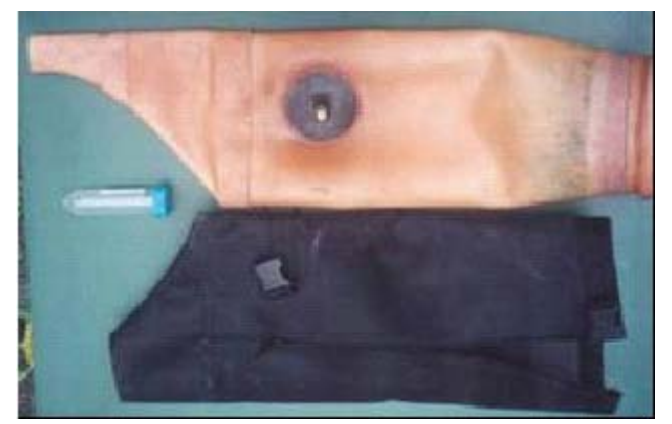
Figure 1. Water-filled latex AV for stimulation of distal tip of the penis.

semen collection methods in the Sumatran rhinoceros. More importantly, it provided the first comparative information on the value of different stimulation protocols for collecting semen in this species. Single stimulation using rectal massage