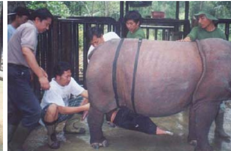
Figure 3. A sequence of rhinocerus semen collection using a combination of (a) accessory glands massage, (b) penile massage, and (c) artificial vagina.