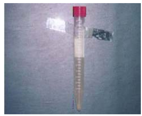
Figure 4. Semen collected from the Sumatran rhinoceros at SRS Way Kambas, Lampung, Indonesia.