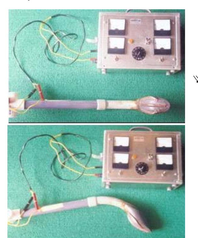
Figure 2. Electroejaculator and the probe for eletroejaculation procedure to collect semen in the Sumatran rhinoceros.