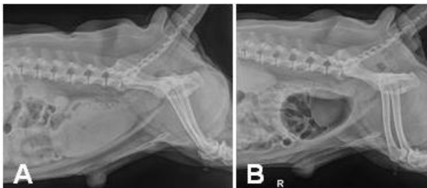
Figure 1 Right latero-lateral plain (A) and negative contrast bladder-urethral (B) radiography showed prostatic enlargement with no cystitis and urethral obstruction.

An 9-years-old male pug dog was examined for stranguria and lethargic in one week. The dog has no testicles as the owner claimed that the dog had been castrated a few years ago. Abdominal palpation shows bladder retention filled with urine but no blockage was found. Urine sedimentation contained blood and few unknown crystal. Hematology showed mild anemia and leukocytosis while blood chemistry only found mild hyperglobulinemia. Radiography showed prostate enlargement (Figure 1).