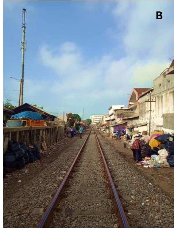
Figure 1 The study area, in Blimbing sub-district, Malang City, East Java showing the study sites circled in red (A) and the local community lives in landfills area around the railroad (B).

head and underbody, fleas, and lice usually predilection on the lower part of the abdomen, and underbody. For chigger mites usually in the ears part. Any ectoparasites were placed in a vessel tube containing 70% alcohol. Each tube was used for each rodent and labeling. After that, removed ectoparasites for processing used alcohol fixation increase concentration, clearing with xylene, and mounting on microscope slides for identification with standard protocols (Herbreteau et al. , 2011; Paramasvaran et al. , 2009).